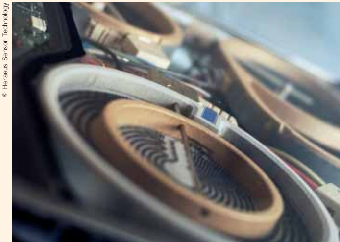
Fig. 1: In millions of ovens and hot-plates platinum temperature sensors in thin-film technology today control the most varied thermal processes from simmering to catalytic cleaning: Typical results from close co-operation with Heraeus Sensor Technology.

Where the respective application demands it, the electrical re-