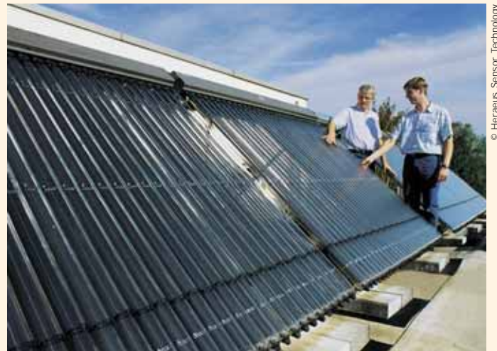
Fig. 2: Circulation pumps of thermal solar collectors are controlled with the signals of platinum temperature sensors (Pt1000) in thin-film technology. Customised products manufactured on a large scale are the speciality of Heraeus Sensor Technology.